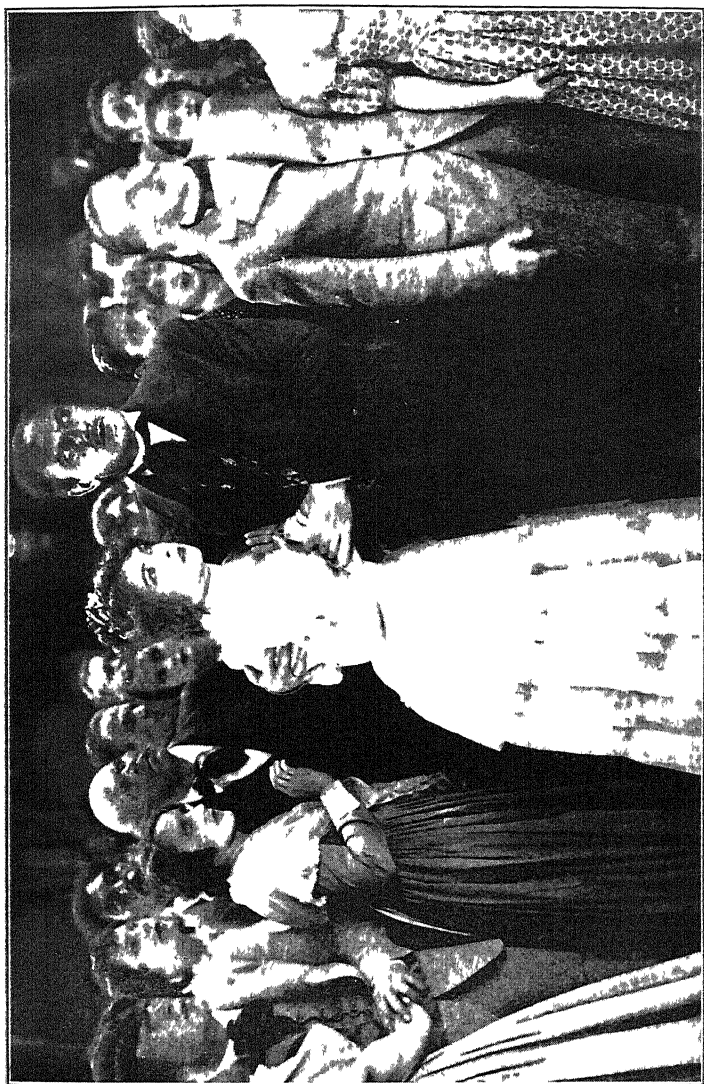
A M O G I in the picture THE APPROACHING STORM AT ARMS ILLIY WHIE RODDY IRIES TO COMIOKI HI K the Hind